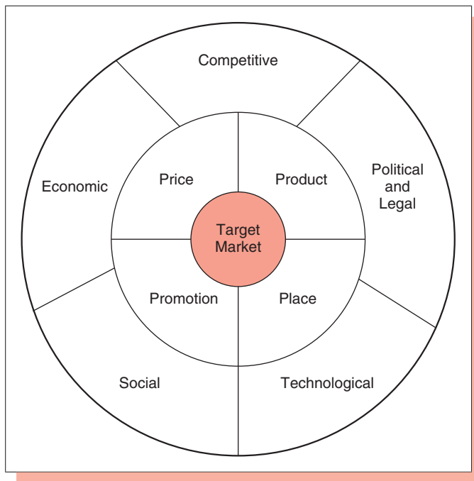
Figure 3.1 The marketing mix and external environments

The concept of a marketing mix originated in the 1950s and was first published in the marketing literature in the 1960s (Borden, 1964). However, the most common form of the marketing mix (i.e., four Ps) used in most textbooks was developed by McCarthy in the 1970s (McCarthy, 1975). McCarthy's four Ps consisted of price, product, place, and promotion. The overall marketing process involves the use of the four decision-making variables within the context of the firm's macro-environment, while focusing on the target market(s). The marketing mix is controlled by the firm, while the macro-environment cannot be directly controlled. The main objective for the firm is to determine a 'mix,' for each product, that satisfies consumer wants and needs and affords the firm a unique position in the marketplace. Firms try to develop marketing strategies utilizing the marketing mix that will establish sustainable competitive advantages leading to long-term growth and profitability. Figure 3.1 is a diagram, used by Reid and Bojanic (2006) in their textbook, that provides a visual presentation of the marketing process.